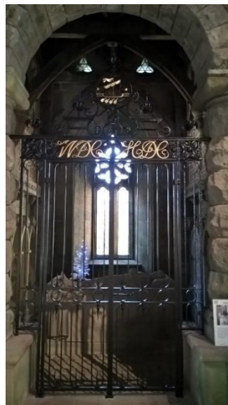
Chapel Gates Transformation (before and after)